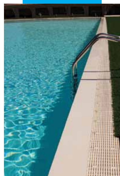
Detail view of a swimming pool dressed with Elastocolor Waterproof