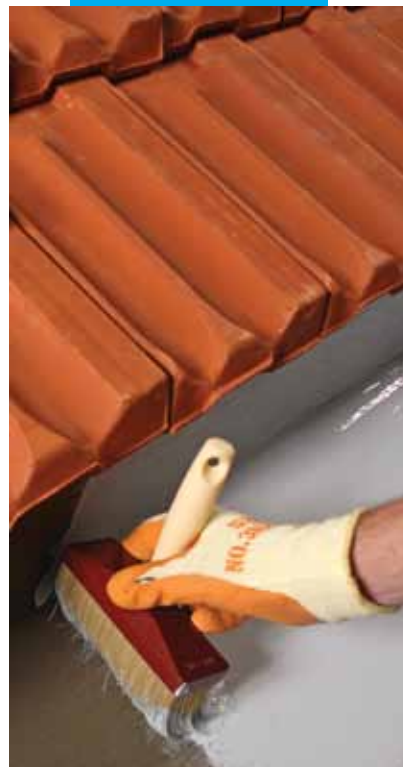
Example of a gutter waterproofed with Mapelastic Smart and coated with Elastocolor Waterproof

All relevant references for the product are available upon request and from www.mapei.com