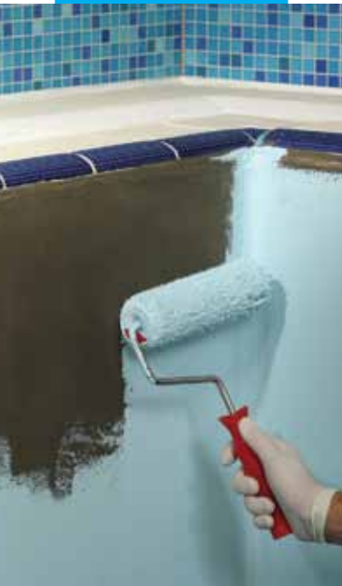
Application of Elastocolor Waterproof with a roller