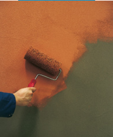
Example of an application of Elastocolor Rasante with a porous sponge roller