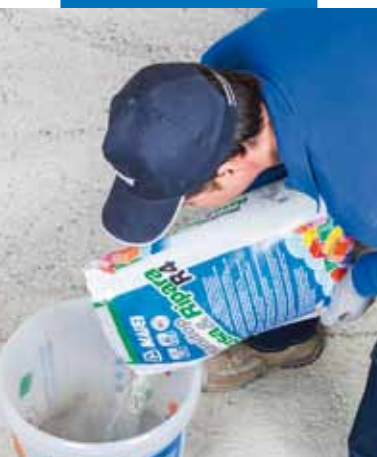
Adding Planitop Smooth & Repair R4 or Planitop Smooth & Repair to the mixing water mixed with Mapetard ES