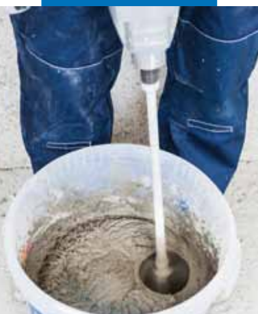
Mixing Planitop Smooth & Repair R4 or Planitop Smooth & Repair