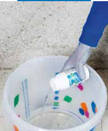
Adding Mapetard ES to the mixing water for Planitop Smooth & Repair R4 or Planitop Smooth & Repair before blending