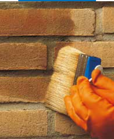
Applying Antipluviol S by brush